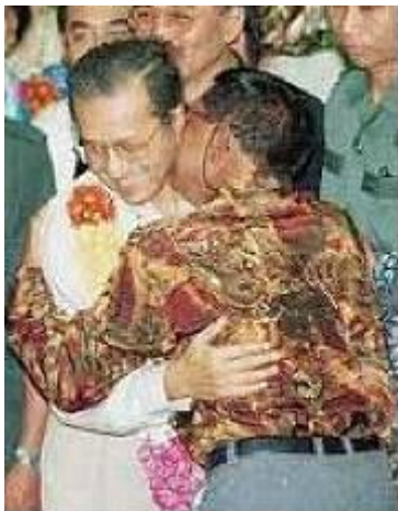
Government expects nothing less than blind loyalty

The Melaka Chief Minister Mohamed Ali Rustam has issued a directive to the State administration to terminate the contracts of doctors and lawyers who are known to be supporters of Opposition parties. A leading official of the civil servants' union, CUEPACS,