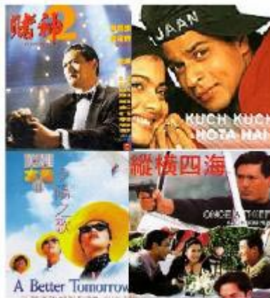
Foreign films: Tools of foreigners out to re-colonise us?

named agreed with statements that Malaysian Chinese watching foreign Cantonese programmes would not want to master the national language. "These foreign programmes will have a detrimental effect on patriotism and are a bad influence on our local