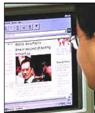
'Unfounded criticism' on the Net can set you back RM 50,000 and land you in jail

The government is also promoting the sharing of information over the Internet by threatening to use the country's Communications and