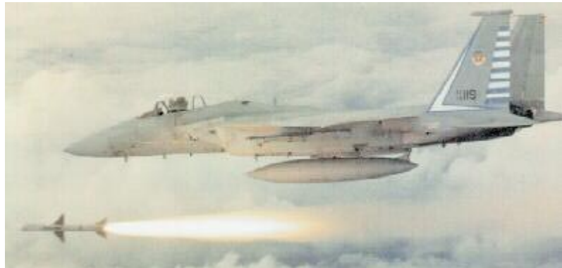
An F-14 Hornet pilot expresses his disagreement with the government's evaluation of the RMAF's flying skills

A leading political leader who refused to be named supported the Ministry's move. "You know, they don't even serve caviar or champagne on those RMAF flights! How are we expected to enjoy our junkets, oops, I mean,