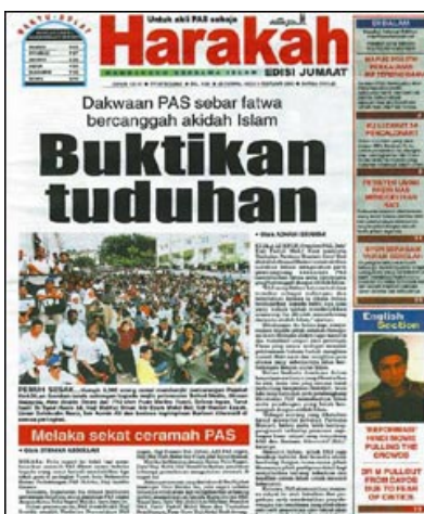
Harakah: Circulation restricted

Multimedia Act to punish people who, according to Deputy Multimedia Minister Tan Chai Ho, "do not exercise self-discipline and publish unfounded criticism.". The maximum penalty for 'unfounded criticism' is RM 50,000 and a year's jail sentence.